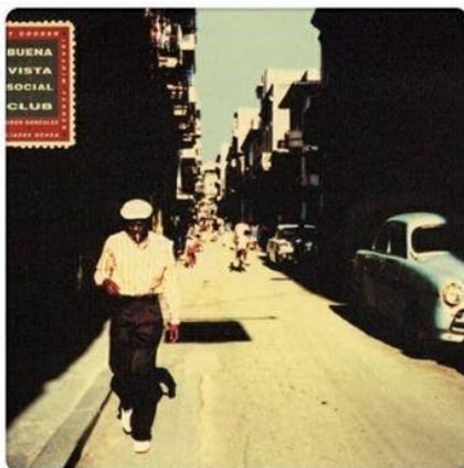
Buena Vista Social...

Welcome to Mental Health Research UK The first UK charity dedicated to raising funds for research into mental illness, their causes and cures.